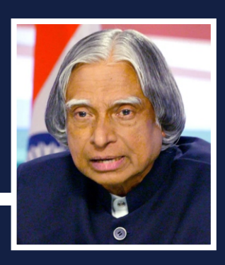
A.P.J. Abdul Kalam

"The purpose of education is to make good human beings with skill and expertise. Enlightened human beings can be created by teachers."